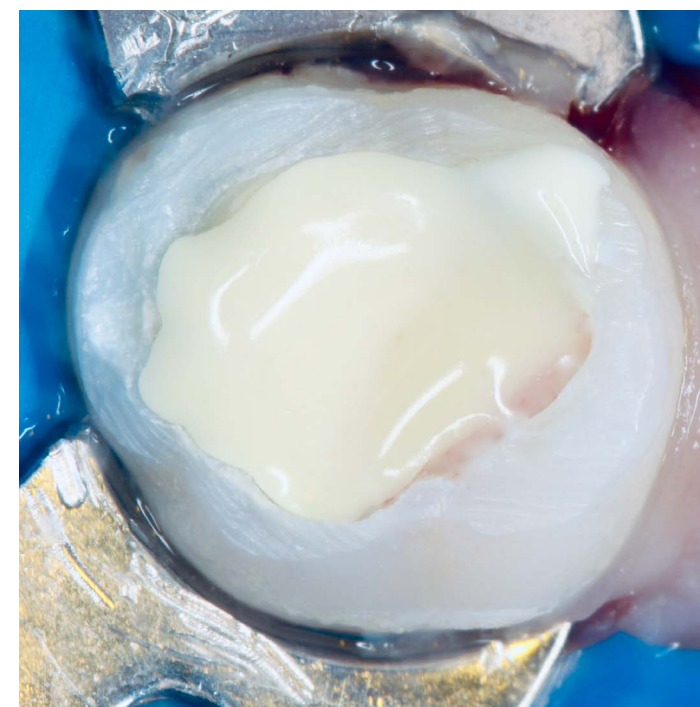
Vital pulp therapy is performed conservatively using TheraCal PT.

challenges. It was very expensive, and pulpotomies aren't high-billing procedures. It also took a lot of work to mix up the material, and it took a long time to set. Over time, manufacturers started developing better materials that were easier to work with, such as TheraCal PT, a unique option that is dual cured, syringeable, and immediately curable."