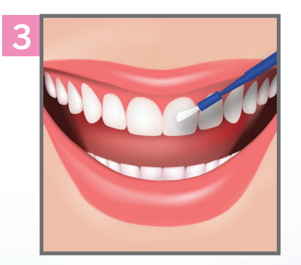
Apply FluoroCal evenly in a thin layer over treatment area.