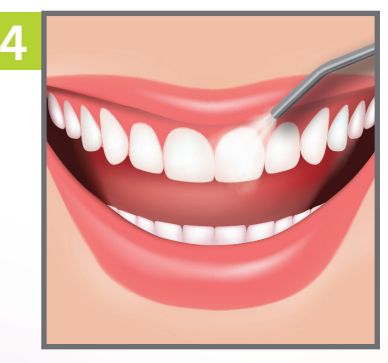
Dry the treated surfaces with air for 10 seconds. Patient should refrain from eating or drinking for at least 1 hour.