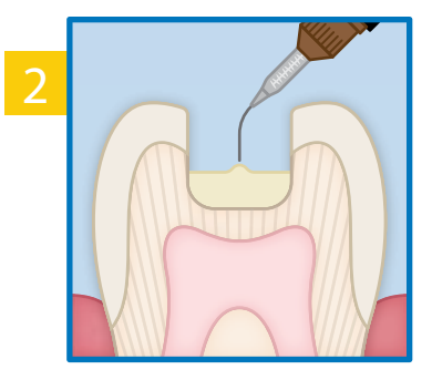
Apply TheraBase to the dentin surfaces of the prepared cavity directly from the syringe.