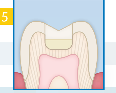
Restore with composite following manufacturer's instructions.