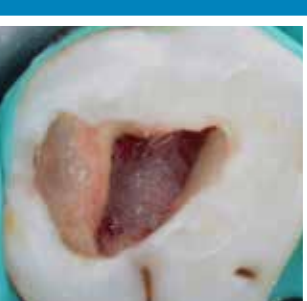
Removal of coronal pulp and hemorrhage control